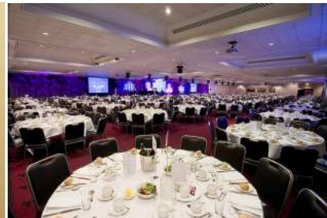
The Celebrity Room at Moonee Valley Race Club. The luxurious Home of INBA.