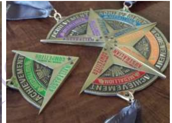
Achievement Atlas (Collect 5 Medals!)